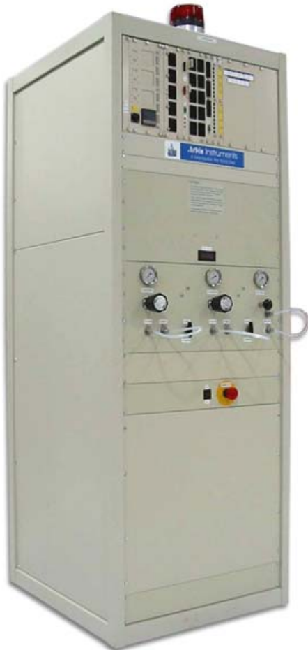
1-channel integrated fuel cell testing system (FCTS) for H 2 -O 2 PEM fuel cell and direct methanol fuel cell testing — 0-5V, 100A/10A and up to 500W