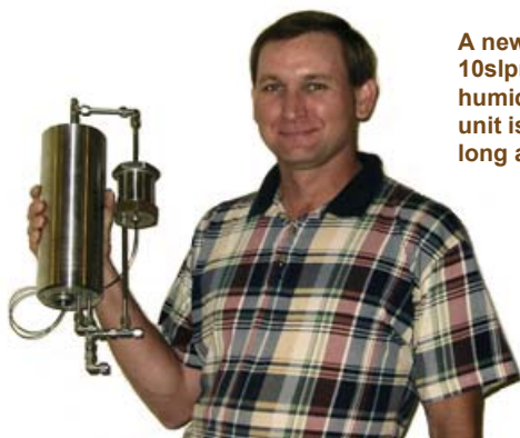
A newly designed 10slpm Arbin dew point humidifier—DPHII. The unit is about 10 inches long and weighs 12 lbs.

The compact size, high energy efficiency and high performance features of the DPHII make it possible to be used not only for a fuel cell testing system but also in a fuel cell engine, as well as other new usages in chemistry, biochemistry, chemical engineering and other fields.